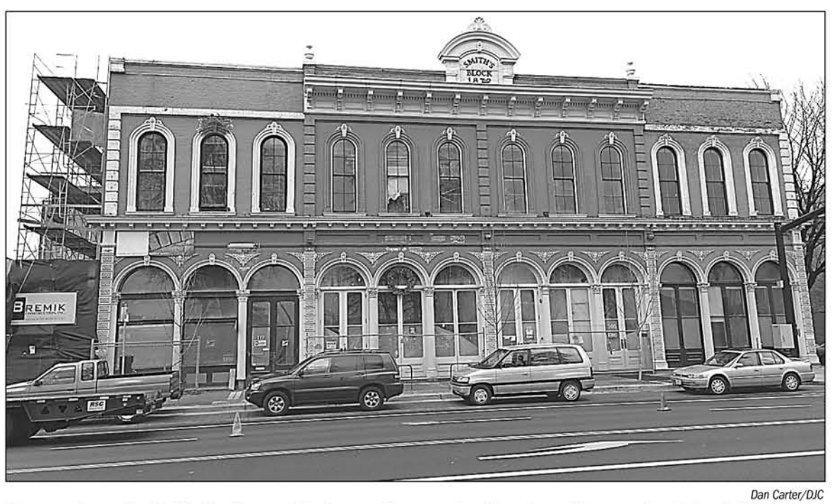
The ornate front of the Smith's Block is one of the few remaining examples of cast-iron architecture along Portland's historic waterfront. The front was designed in Italianate style, which was popular during the late 19th century when the building was constructed.

Pierson and crew are currently doing seismic renovations on the building's interior, reappointing the brick and grinding out the old mortar. The un-reinforced masonry walls make this a slow and delicate process. Pierson said they are looking at a June completion date with occupancy in July. "This has been quite a challenge," Pierson said. "It's so much different than building a new building from the ground up. In some places you can walk up and pull the bricks right out of the wall." Bremik plans to leave as much of the original brick exposed as possible so the building maintains its historical character. The ornate castiron front of the building, designed by Oregon architect W.W. Piper in Italianate style, will also be cleaned up and rebuilt so it looks original. A giant skylight at the top of the building will be replaced, as well as 22 windows. "Everything will be new, mechanical parts, plumbing, energy efficient windows; it will be a brand new building," Pierson said. Bremik is not the first to clean up the Smith's Block. In 1955, the northern part of the building was leveled to create a parking lot. In the 1980s, it underwent a rehab which included the installation of an elevator core. Originally a two-story building, the building's roof was raised and a second floor was added somewhere along the line. The third story floor is original and its age is apparent by the old two-by-four beams that run through it.